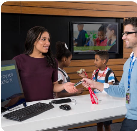
EasyLobby Solo is relevant for not only traditional businesses, but also for schools, clinics, health clubs, and childcare centers.

Free trial download available from: hidglobal.com/easylobby-demo