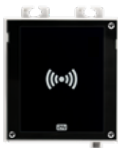
2N® ACCESS UNIT 2.0 RFID ord. 9160334 9160334-S (secured)