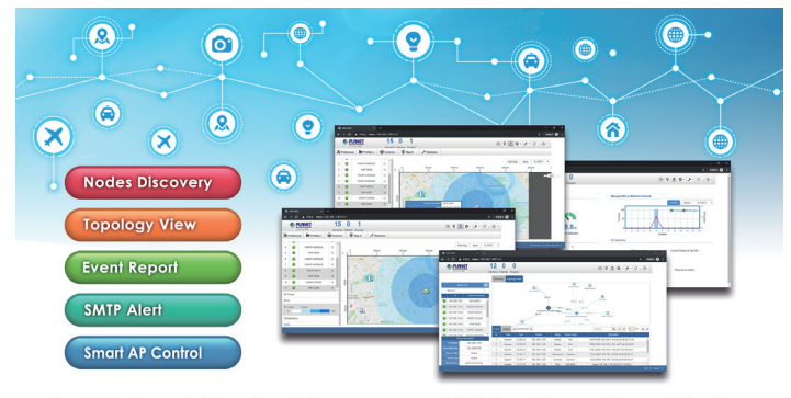
Let Network Device Management Make Operations Easier

PLANET's NMS-500 Network Management System can monitor all kinds of deployed network devices, such as managed switches, media converters, routers, smart APs, VoIP phones, IP cameras, etc., compliant with the SNMP Protocol , ONVIF Protocol and PLANET Smart Discovery utility . It thus enables the administrator to centrally manage a network of up to 512 nodes from a central office, greatly boosting network and power management efficiency. With its user authentication management, the NMS-500 enhances data transmission security in the modern factory automation systems.