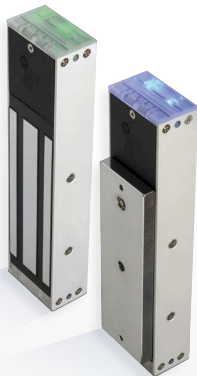
V5S V5SR V5SRB [WITH BUZZER]