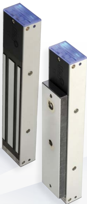
V3S V3SR V3SRB [WITH BUZZER]

Illuminated surface mount electromagnetic locks