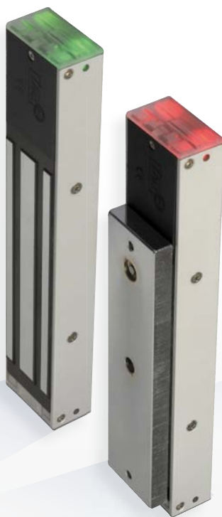
V4S V4SR V4SRB [WITH BUZZER]